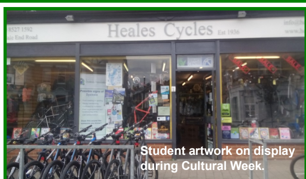
Student artwork on display during Cultural Week.